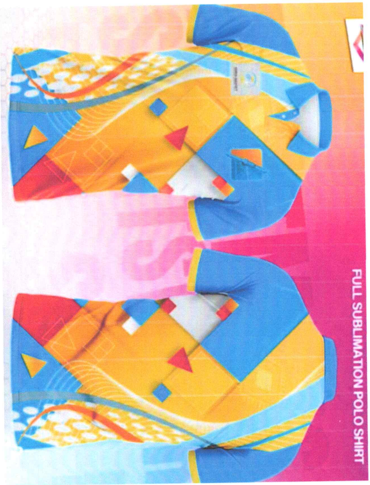
FULL SUBLIMATION POLO SHIRT